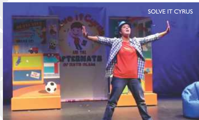
SOLVE IT CYRUS